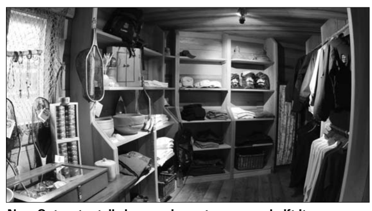
New Outpost retail shop carries outerwear and gift items.

While many resort guests come back time and again, many of you are due for a return visit. There have been a few changes, and things just keep getting better. This last year saw the conversion of the original kitchen roundhouse to a games room with no-host lounge bar, and a gift shop. So now, in addition to the original games tent with its turn-of-the-century snooker table, poker table and board games, guests can enjoy full-size billiards and foozeball in the new games room.