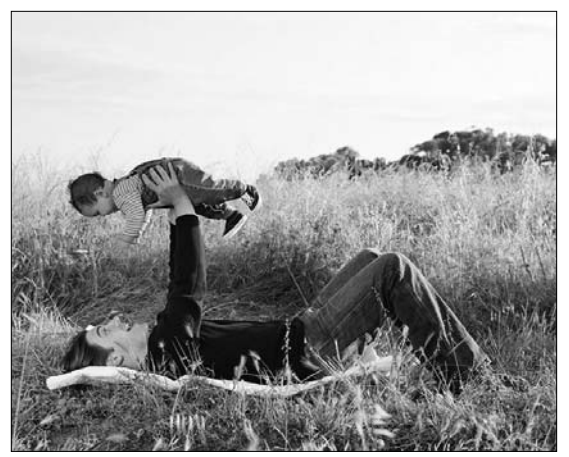
Conservancy gifts benefit future generations.

Remember when the latest and greatest birthday gift trend was to buy your loved one their very own star to wish upon? I have one. Someone out there in a major or minor cluster of equally anonymous twinklers, an orphan sun has my name on it. A romantic ideal to be sure, but one that benefits only the seller, whom by the way, did not own it in the first place (why didn't I think of that?).