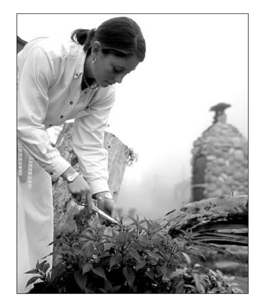
Outpost's organic herb garden creates no carbon footprint.

*southamptonsustainability.org/carboncalc.htm