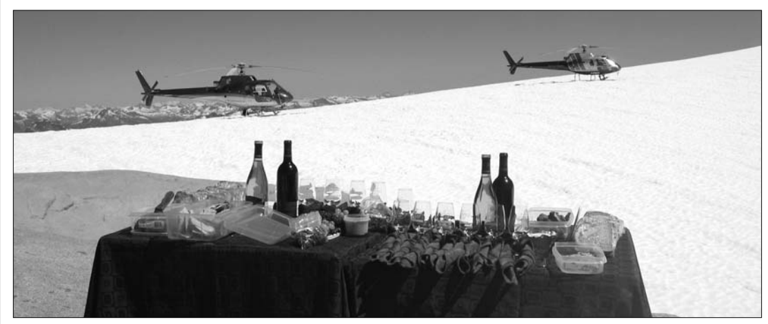
Nimmo Bay's legendary gourmet 'picnics à la glacier' are a memorable part of the resorts' new HorsePower Safari partnership.

was a natural one. HorsePower Safaris are offered on a limited basis to couples and individuals only during the week of June 18 - 25, 2006. Parties of six or more can reserve at anytime. Three and one-half days at each resort promise once-in-a-lifetime memories, spectacular cuisine, and thrilling adventure. For more information and rates visit www.horsepowersafaris.com.