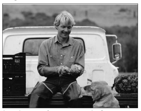
Local oyster farmers supply Outpost.

amount of fossil fuel burned to service large commercial farms, and transport produce (oftentimes internationally) via refrigerated truck or aircraft, is enormous by comparison. Also, buying locally reduces the amount of energy needed to long-haul package, process and dispose of (spoiled in transit) non-local products as well.