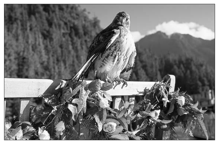
Green getaways, even weddings, pay surprising dividends.

It is true that money, your money, talks. It speaks for fragile environments and endangered animals that cannot speak for themselves. It also affords us choice—to buy organic