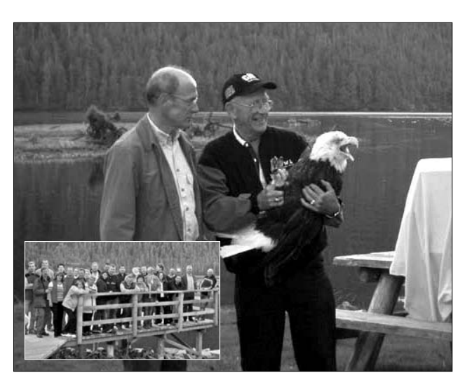
Skoda executived release three rehabilitated eagles into the wilds of Clayoquot, September 2005.

There is no getting around it—business travel exacts a heavy toll on the environment, but the news isn't all bad. Increasingly, successful corporations are discovering that long-term, sustained profitability depends largely on responsibility and ethics.